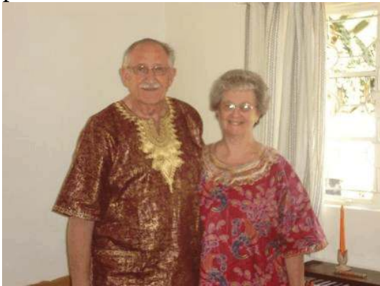
Here we are in our African garb!

We have finished our Swahili classes. Can we talk Swahili now? NO!! But we can understand some of it and we are trying. The staff here is great in helping us. Now we need to put to practice what we have learned.