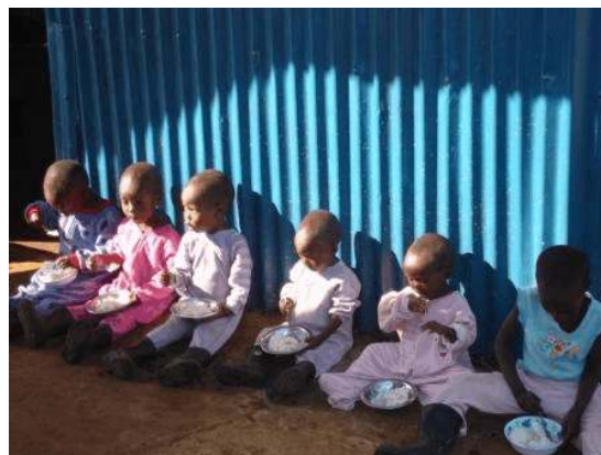
Foster children eating breakfast